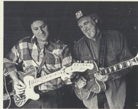
AR & Duane Eddy